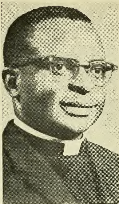
Bishop Abel Tendekayi Muzorewa